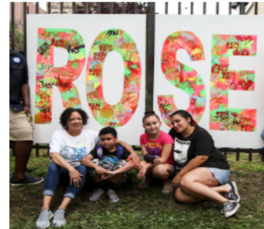
Art-Making with Ben Rose Gardens Community